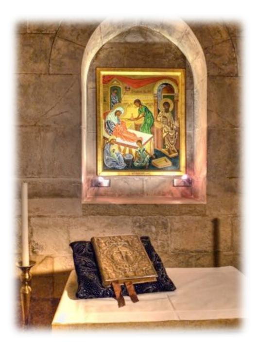
Grotto and Basilica of Saint Anne.