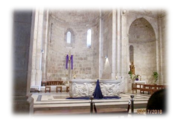
Sanctuary and altar of the Basilica of Saint Anne.