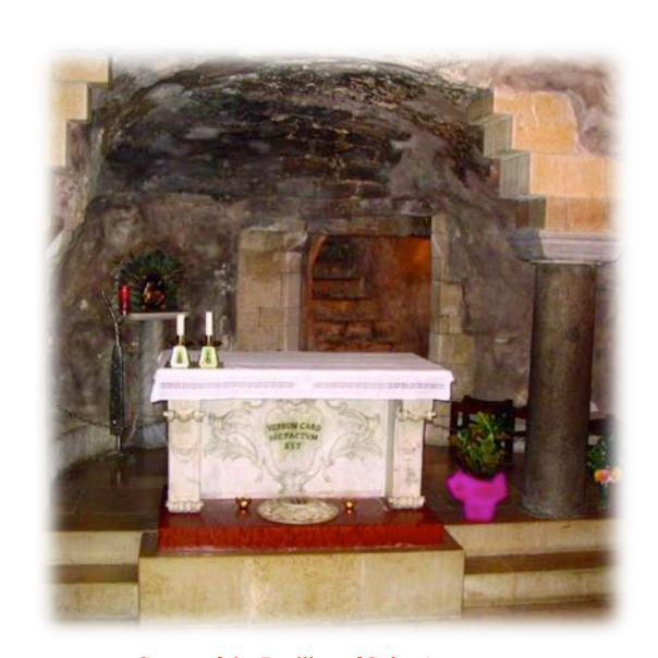
Grotto of the Basilica of Saint Anne.