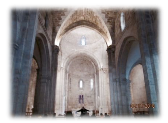
Nave of the Basilica of Saint Anne.