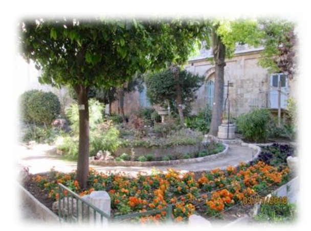
The gardens of the Basilica of Saint Anne.