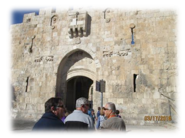
The construction of the Walls of Jerusalem and its gates are credited to Suleiman the Magnificent in 1539.